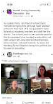
wolfer defamation2.jpg 203K

Yamhill Advocate <yamhilladvocate@gmail.com>