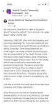
wolfer defamation1.jpg 73K